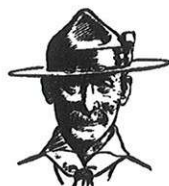
Robert Baden Powell — Founder